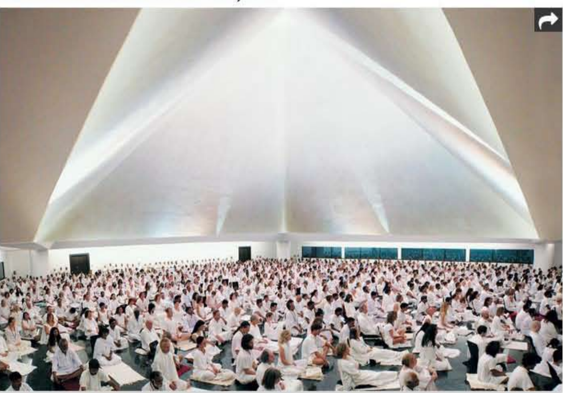
There are 10 meditation sessions every day at the Osho International Meditation Resort, starting at 6am.

Chief patron: Osho Philosophy: That the 'new man' or 'homo novus' is someone who is at home in this world and the spiritual one. The place: A garden with tall trees, plenty of black marble and wide open spaces. Against this stark vista of green and black, spend your mornings in deliciously relaxing one-hour drop-in sessions of Tai Chi, Chi Gong and Zen archery. There are 10 meditation sessions every day, starting at 6am. There's an Olympic-size pool, spa, gym, cyber café, tennis courts and three dining areas with everything from Asian mains to coffees and pastries. In addition to a small bank, the campus has a store (Galleria) where residents can buy the maroon and white robes required for meditation, magazines and more. And as night falls, the place comes alive with meditations under the full moon, music performances and movie screenings. Getting in: Anyone can go as long as they can pay for the stay and pass the HIV/AIDS test, but bringing children is not encouraged.